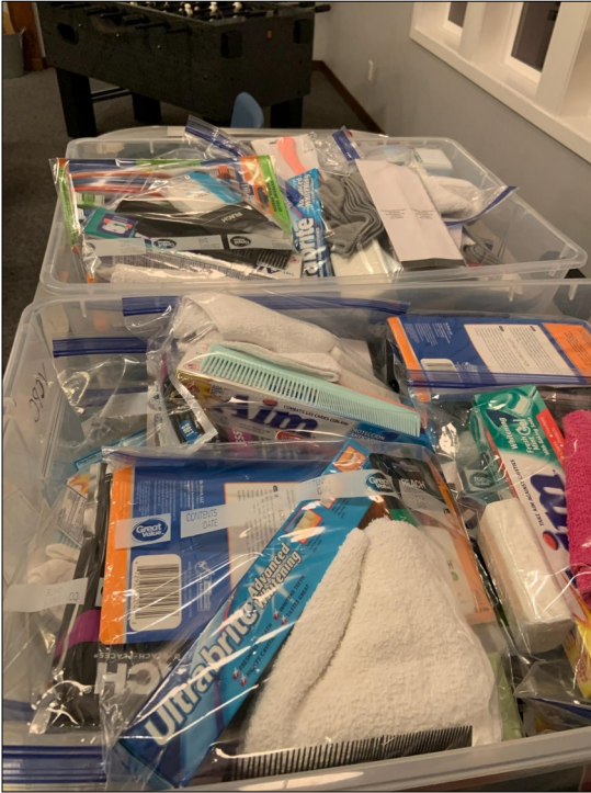
Left: The youth assembled care packages for Medical Teams International.