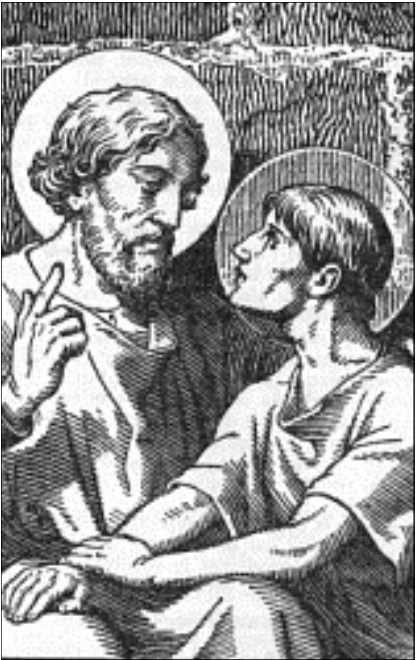
Paul and Onesimus

POSTLUDE Please remain seated to conclude worship with the postlude.