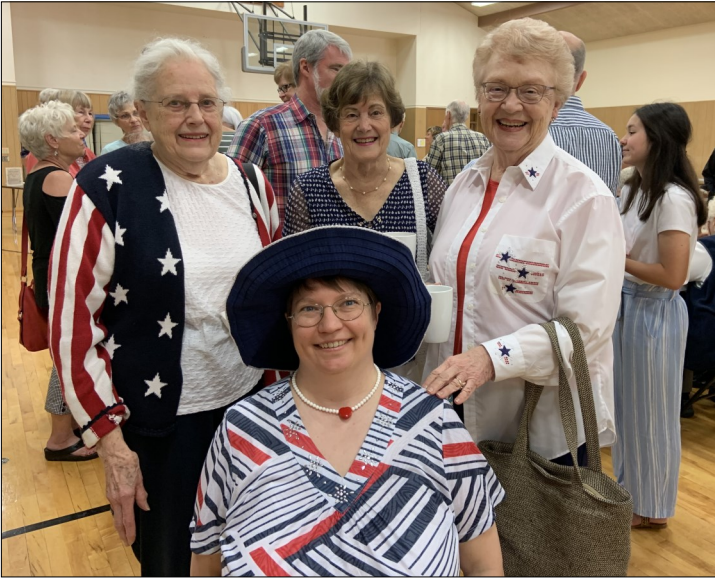
Fourth of July pride at Valley.