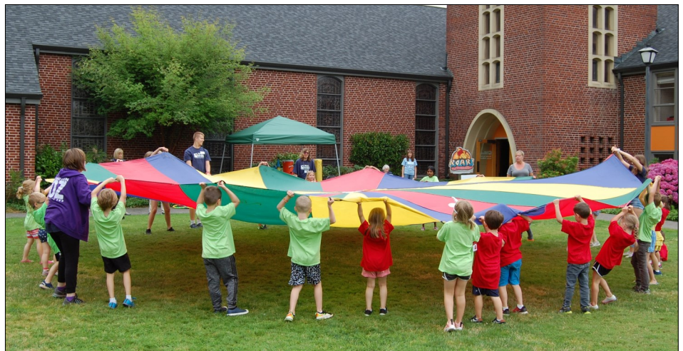
Recreational time was a favorite of the campers!