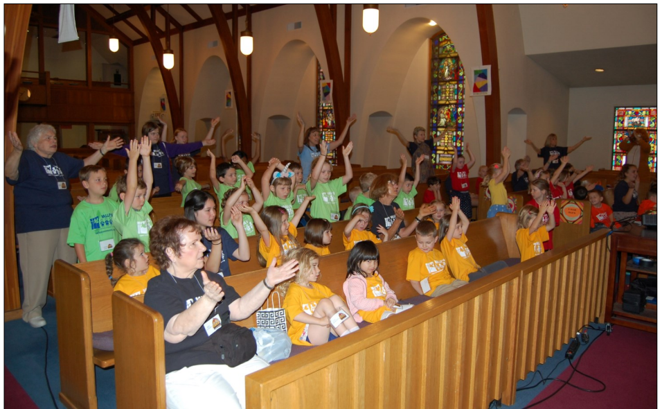
Learning songs in the sanctuary.

The 2019 VBS theme, ROAR - Life is Wild, God is Good , allowed kids to explore God's goodness and celebrate a ferocious faith that powers them through this wild life. Over 45 children enjoyed a week long adventure at Valley learning Bible stories, making crafts, enjoying drama skits, activities during recreational time and so much more! (See p. 7 for VBS thank you.)