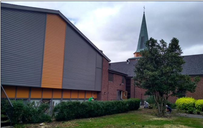
Left: An Eagle Scout project will spruce up the courtyard.