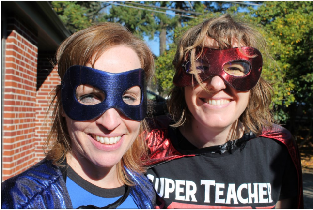
Super teachers of Valley Christian Preschool.