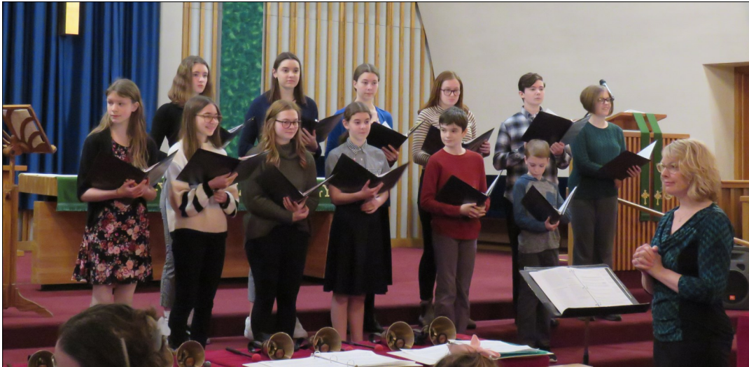
Valley Youth Group sings during Youth Sunday.