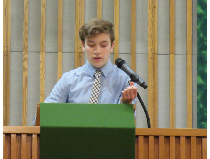
Youth Sunday included many elements of worship put together by Youth Group students. This included preparing and giving the sermon.