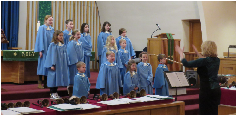
The King's Kids and Cherub Choirs sang the anthem on Youth Sunday.