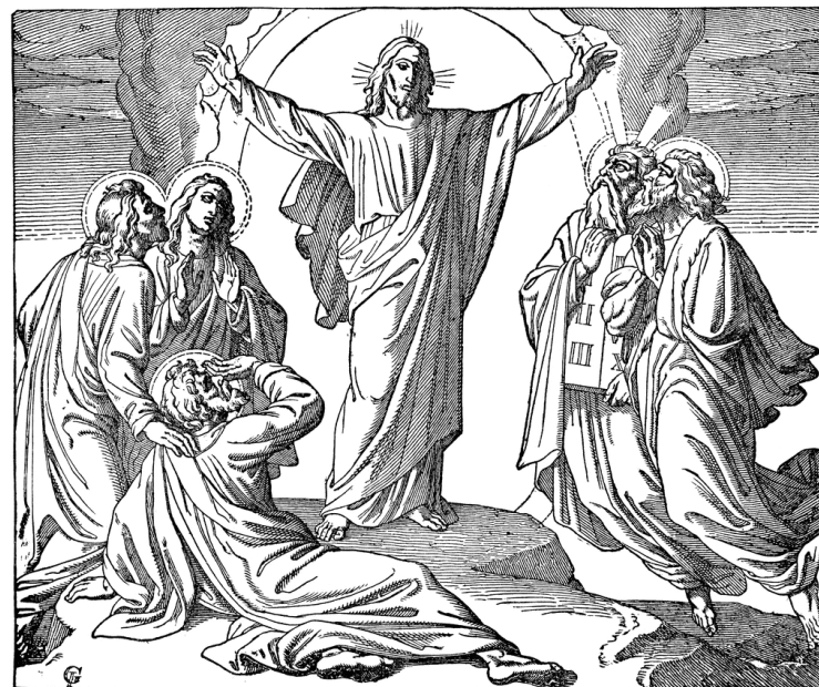
Transfiguration of the Lord

You are invited to remain seated to conclude worship with the postlude.