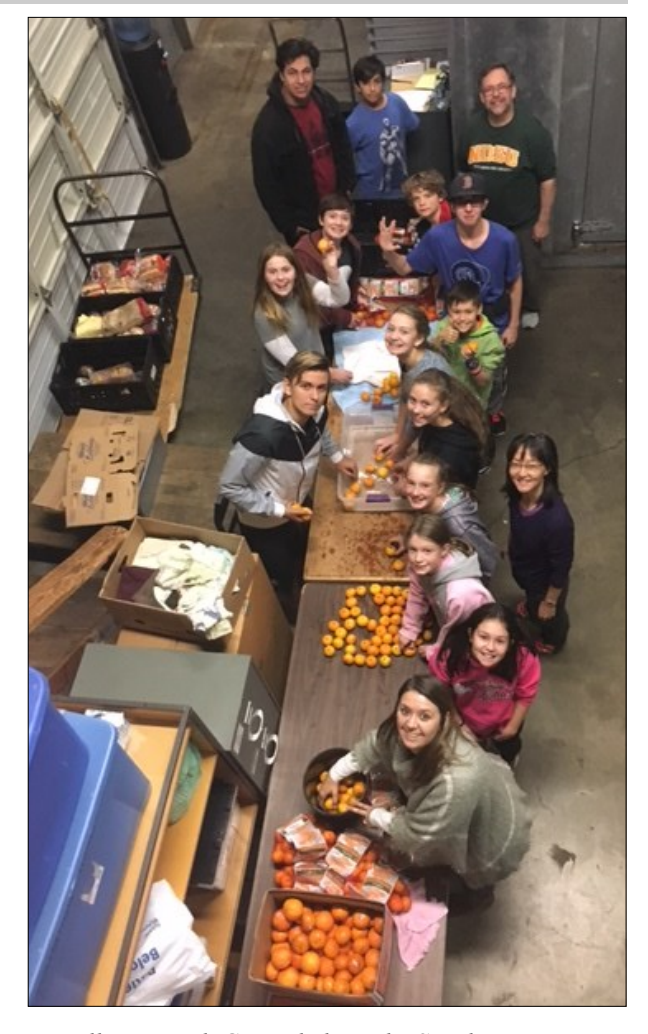
Valley's Youth Group help at the Sunshine Pantry.

Please remember to check out the youth fundraiser at the Mission Market on November 12. The youth will be working with Willamette Valley Pies again. There will be frozen pies for sale at the Mission Market to take home and bake, and pre-order forms available for additional varieties of frozen pies to be delivered on December 5. We pre-ordered 20 frozen pumpkin chiffon pies and 120 frozen fruit variety mini-pies for purchase at the Mission Market. This fundraiser was quite successful in the spring and the youth families felt that having pies in time for the holidays would be a delicious treat.