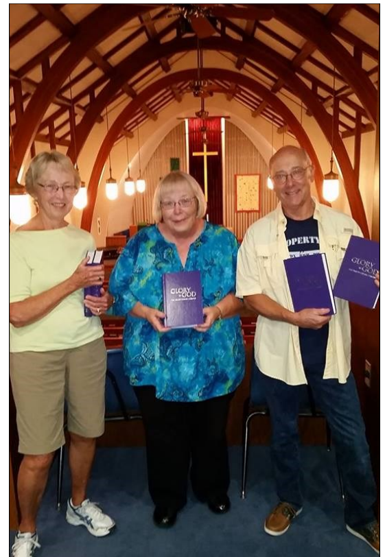
The remainder of the new hymnals have arrived! The old hymnals will be available free of charge for anyone who would like one on Sunday, September 10 - Kick Off Sunday.