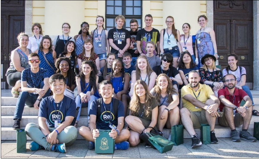
Students at the International Youth Conference in Hungary.

another, and (3) all needs were met. The world today is quite the opposite: our relationships with God are broken, humans are in constant conflict, and many people around the world suffer in need.