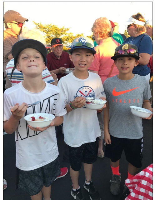
A strawberry shortcake treat was enjoyed by many Valley attendees after a recent Hillsboro Hops Game.