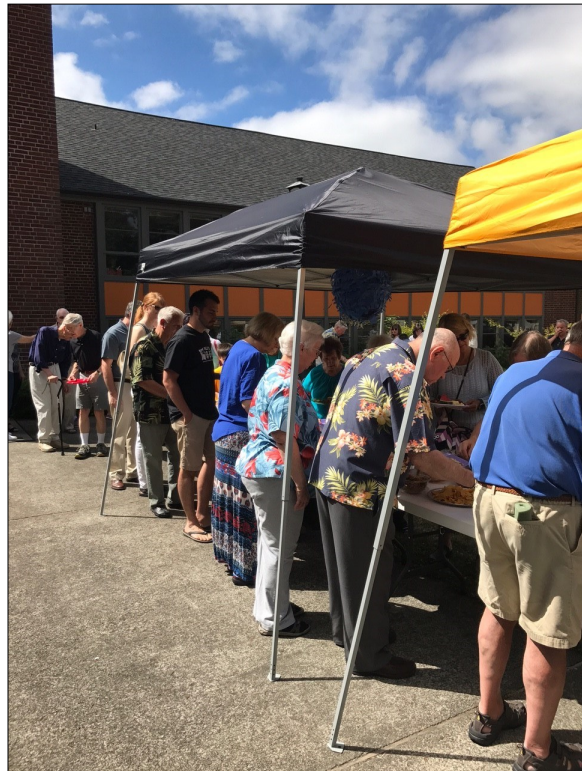
The annual All-Church Picnic was well attended!