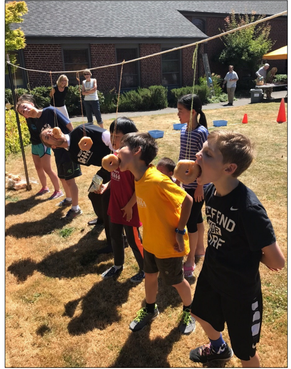
The doughnut eating contest is always a popular game at the All-Church Picnic.