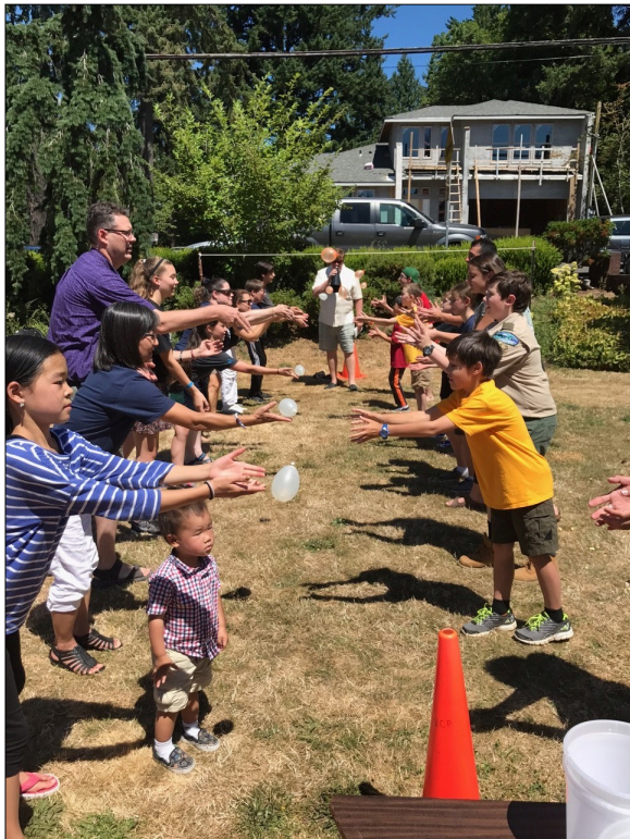
A water balloon toss at the All-Church Picnic helped keep participants cool.