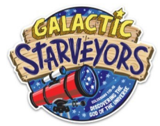
This year's Vacation Bible School was a big success! The children learned all about God's love through music, games, crafts, Bible study, and so much more.