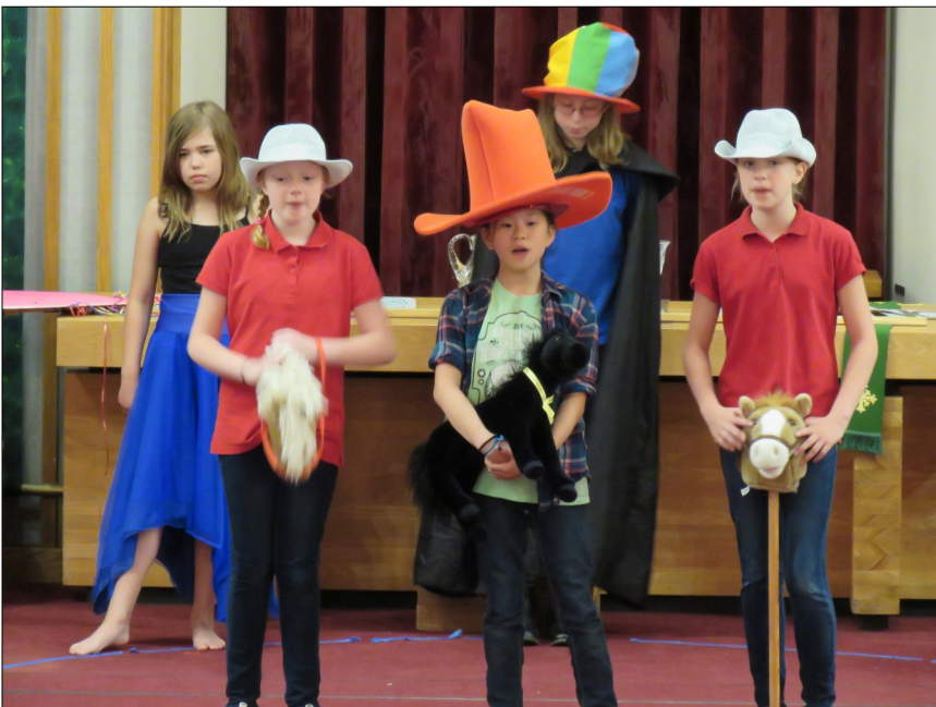
Left and above: The Music and Drama campers worked hard all week to learn the musical, Step Right Up, and presented it to Valley's congregation during worship on July 2.