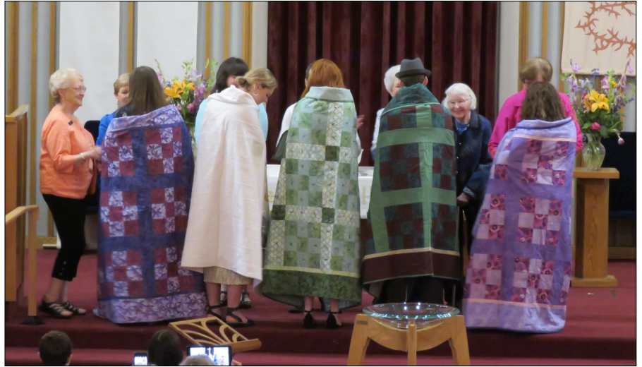
Above and below: Valley's graduating seniors were presented with beautiful hand-made quilts by the Holy Nine Patch Quilters during worship.