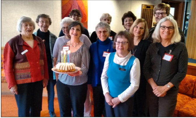
DFW April meeting celebrating five years as a chapter at Valley.

Dining for Women learns about health in Mali at the monthly meeting on Sunday, May 21. The featured grantee this month is Mali Health, and their mission is to reduce maternal and child mortality in resource-poor communities in West Africa.