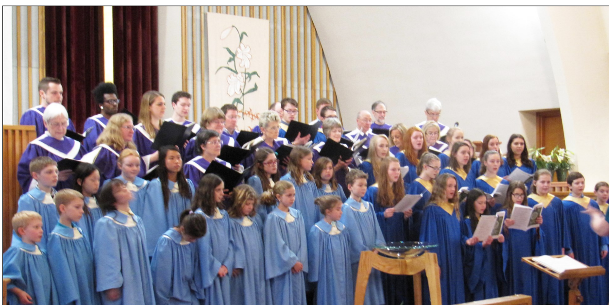
Combined choirs proclaimed the Word of God on Easter morning.