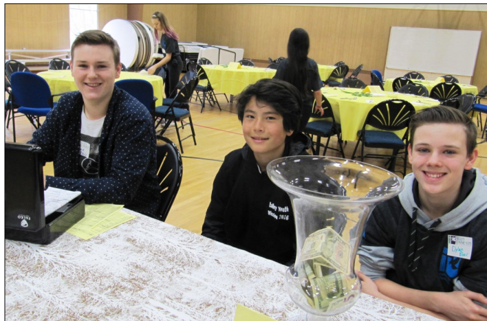
Valley youth held a pancake breakfast to raise funds for upcoming mission trips.