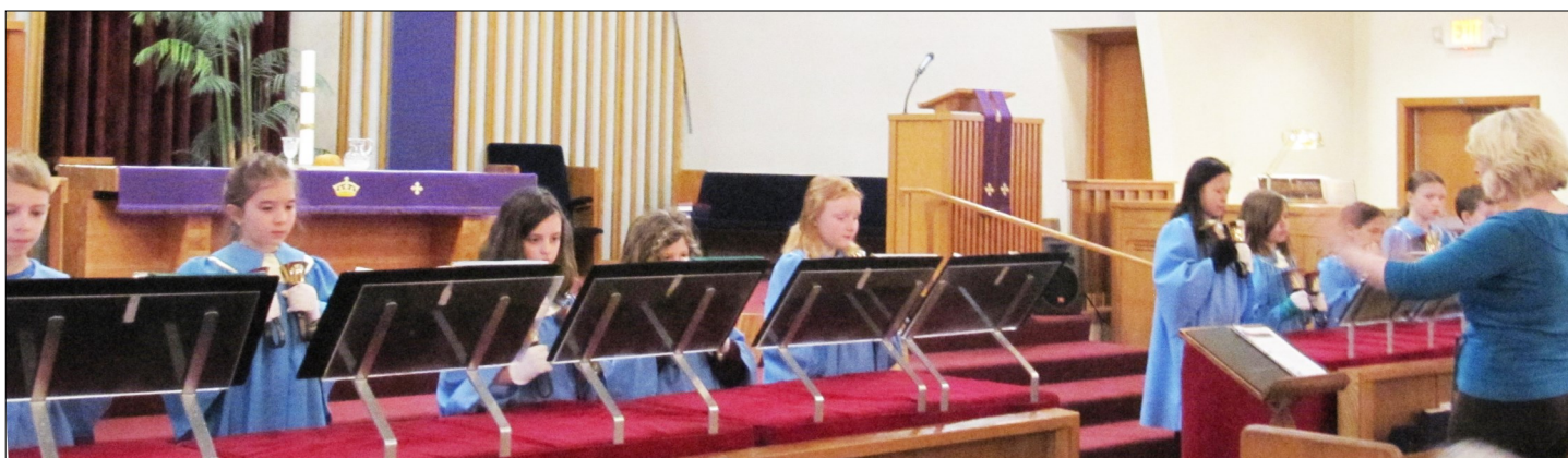
The Royal Ringers played during a recent worship service.