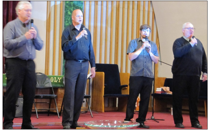
Above and left: The Grace Brothers and Oregon Wild West Trio provided spirited bluegrass/gospel music during worship on Kickoff Sunday.