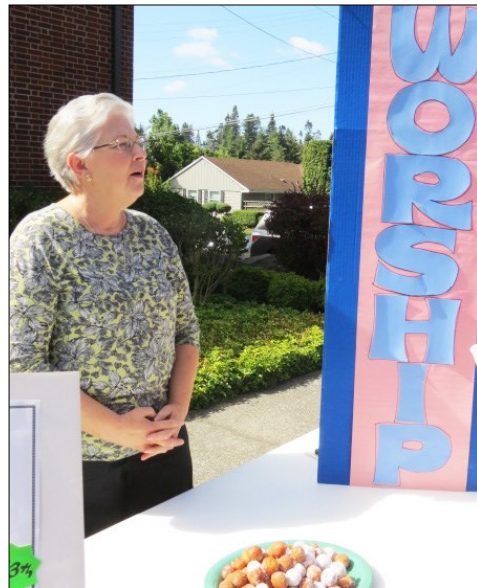
Many of Valley's ministries had tables with information available during the annual Fall Kickoff.