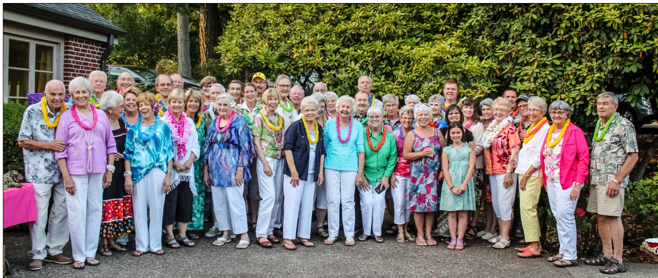
The Clippers and Navigator Mariner Ships gathered for a luau get together.

Dining for Women Changing the World One Dinner at a Time