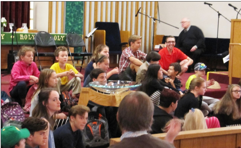
Children and youth gather around to hear the Time with the Young Church.