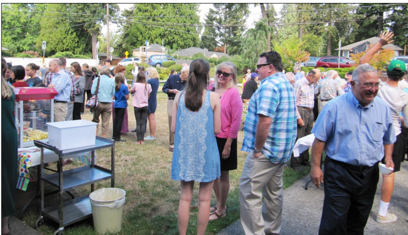
Many were in attendance at the Ministry Fair on Kickoff Sunday.