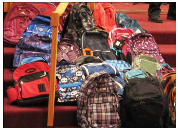
Backpacks were collected for Project BACK which help assist local school children.