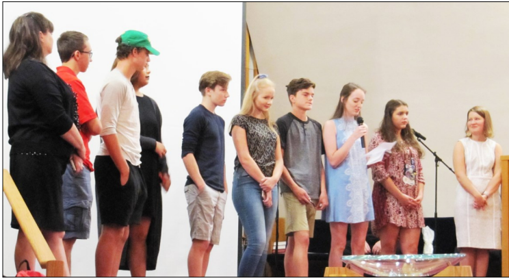
High Schoolers tell congregation about their Youth Triennium trip to Indiana.