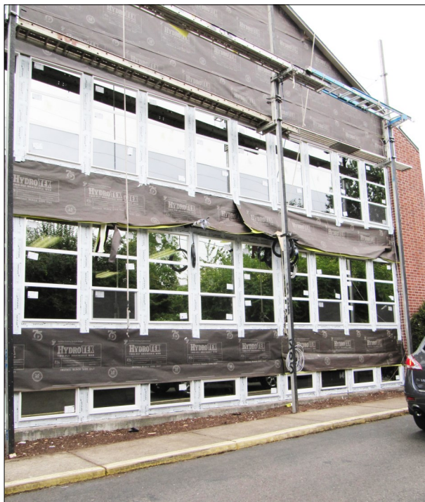
Above and right: New windows and siding are being installed on the south side of the church.