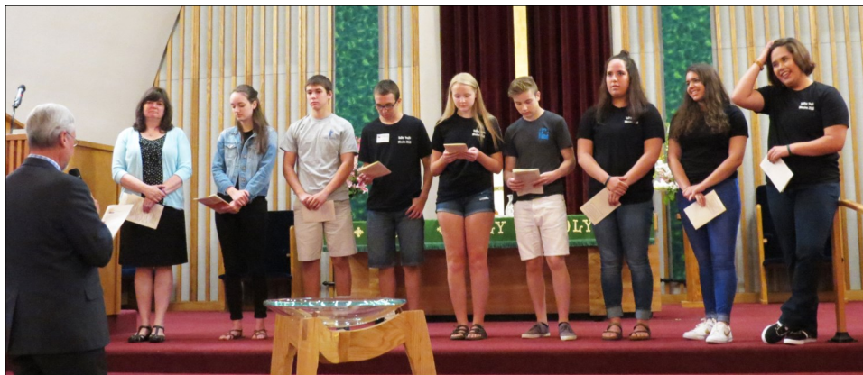
Right: High School youth are commissioned during worship before heading to Triennium.