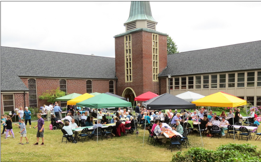
The weather was perfect at the annual All Church Picnic.