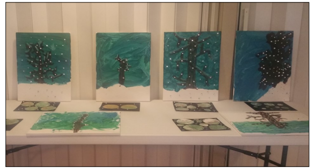
Children learned about drama, music, and art during the Arts Exploration Camp.