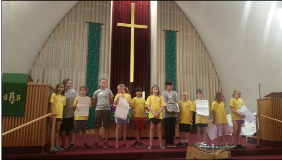
Right: Campers and youth helpers tell about their fun-filled week of helping others during Camp Mission.