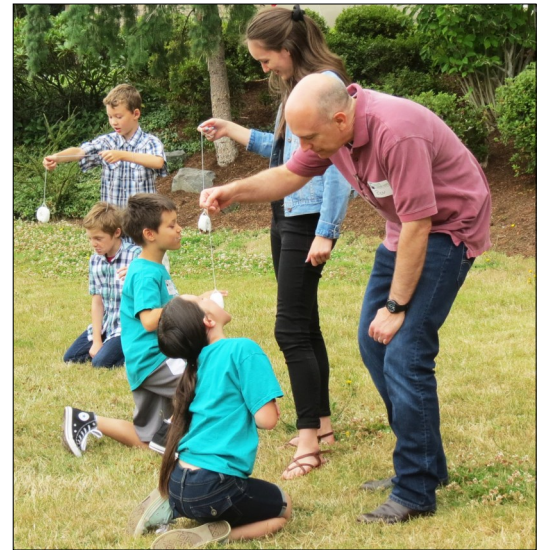
One of the traditional games is trying to eat a donut on a string without using your hands.