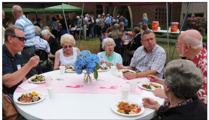
Valley's annual All Church Picnic was well attended and enjoyed by all!