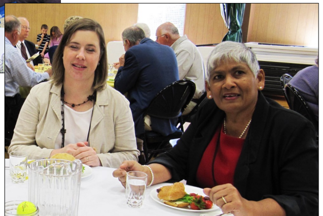
Above and right: Delegates from the General Assembly enjoyed lunch and fellowship at Valley after worship.