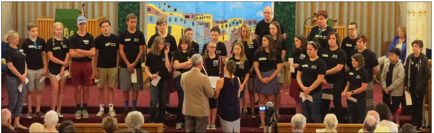
Youth and adults are commissioned during worship as they prepare to leave for their mission trip to Eastern Oregon.

Thank you to each and every member of this church family for your love, support, and care. Twenty-three youth and eight adults are having a great Youth Mission Trip at Westminster Woods Camp, June 26-July 2. We are working on various projects around the camp, including staining and painting picnic tables, piling and covering slash from dried trees, installing forest inventory plots, thinning small trees, splitting and stacking firewood that was donated to families in need this winter, building a “cave” for their church’s upcoming VBS, designing cards for their deacons to use, and painting Bible verse canvas art to decorate the camp’s facilities. We are serving alongside Tutuilla Presbyterian’s youth group, a church located on the nearby Native American reservation. We are experiencing lots of things, feeling God’s presence in fascinating ways, and we are having a lot of fun together. Thank you for your prayers and for wearing the colorful bracelets all week as a reminder to pray for us!