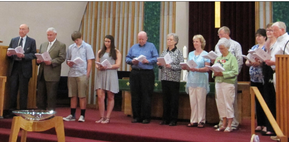
Church officers were ordained and installed at a recent worship service.