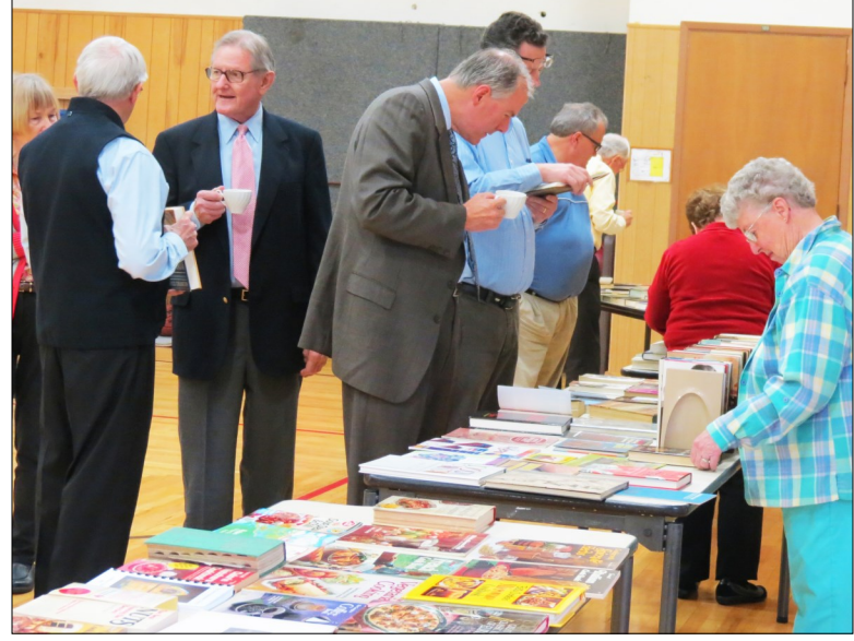
The proceeds from the annual book sale will contribute to the purchase of new items for the Gamble Library.