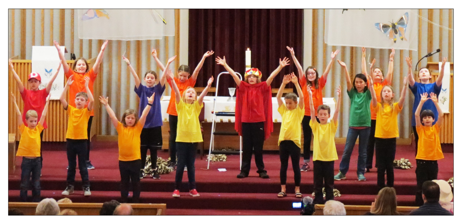
The King's Kids Choir presented, "Rescue in the Night: The Story of Daniel in the Lions' Den" during Sunday worship.