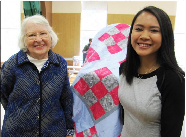
Some of the high school quilt recipients with their quilt makers on Graduate Recognition Sunday.