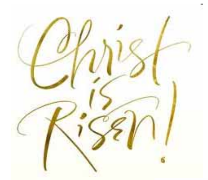
Easter Sunday March 31 Worship 8am and 10am Breakfast 8:30-9:45am