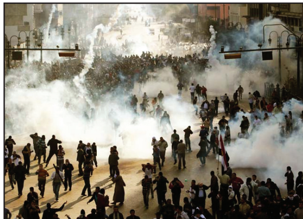
Protesters flee from tear gas fire during clashes in Cairo.

“The BBC comments: ‘The Arab order is crumbling. But whether it will collapse or somehow re-invent itself is far from certain. Arab rulers, from North Africa to the Gulf, in rich countries and poor, find themselves in essentially the same boat. Virtually without exception, they preside over corrupt autocracies with little or no legitimacy in the eyes of their people.’