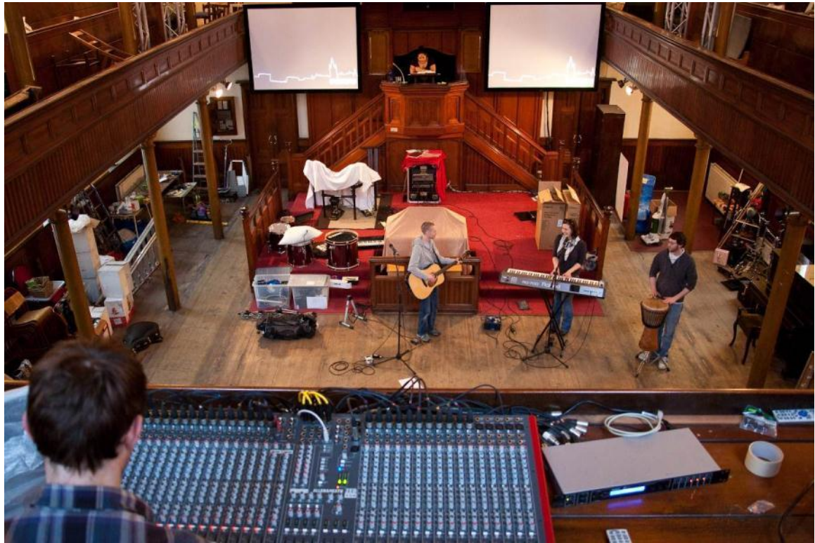
Converted to Reach the Next Generation of University Students and Families