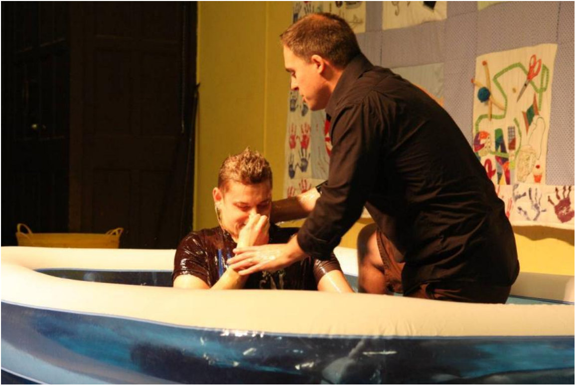
Nine baptisms the first Sunday!