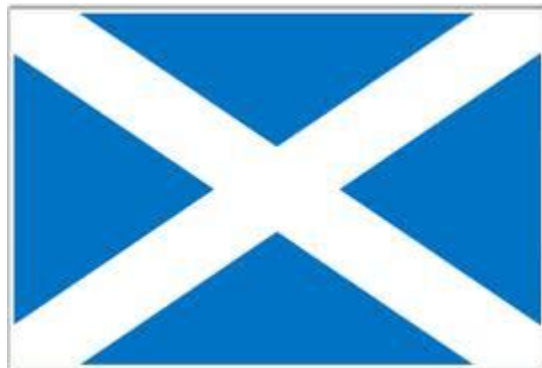
Flag of Scotland