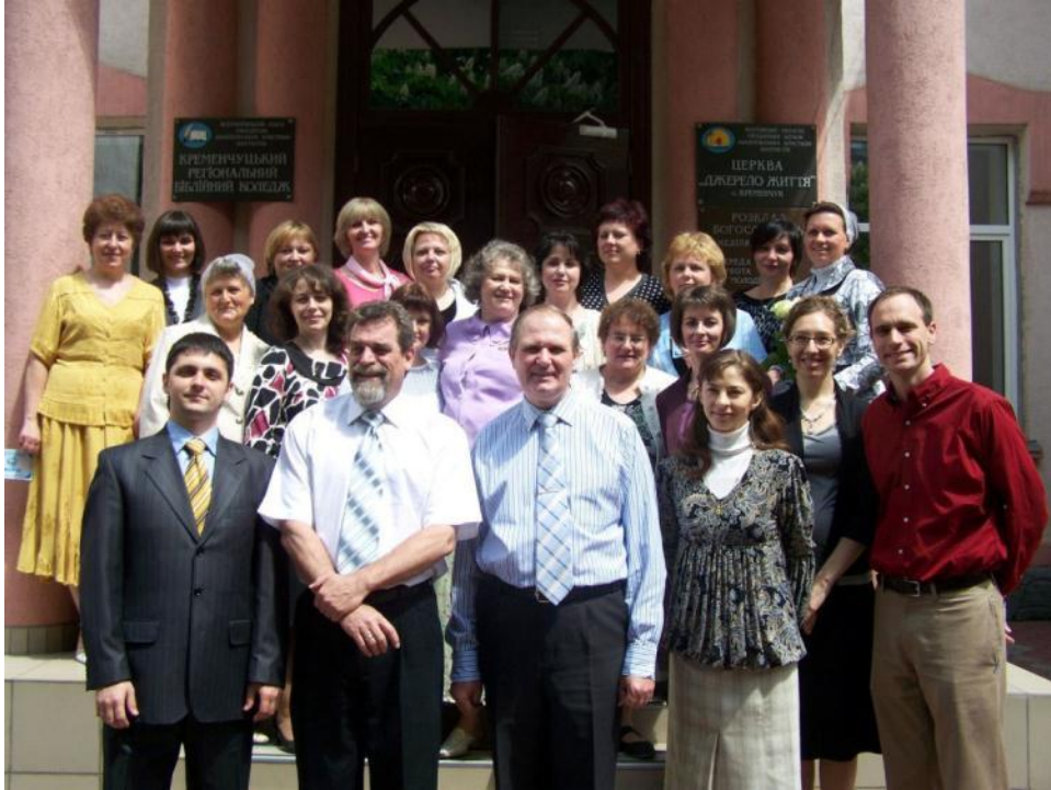
College and Seminary Staff