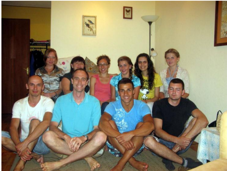
Home Small Group