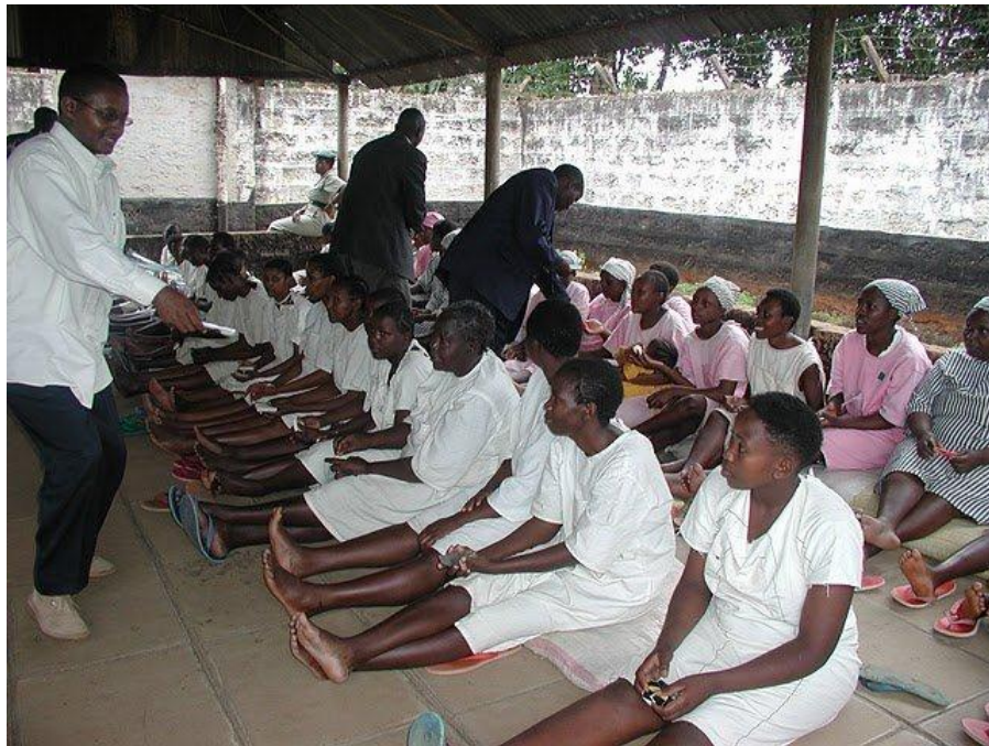
Women's Prison in Kenya