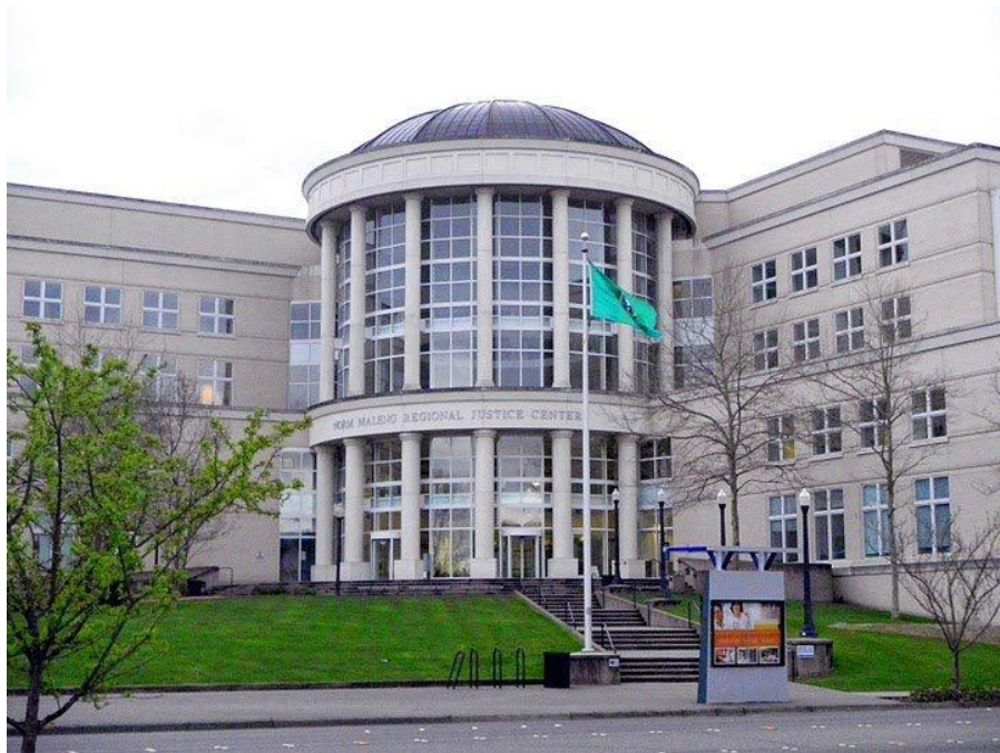
Kent Regional Justice Center