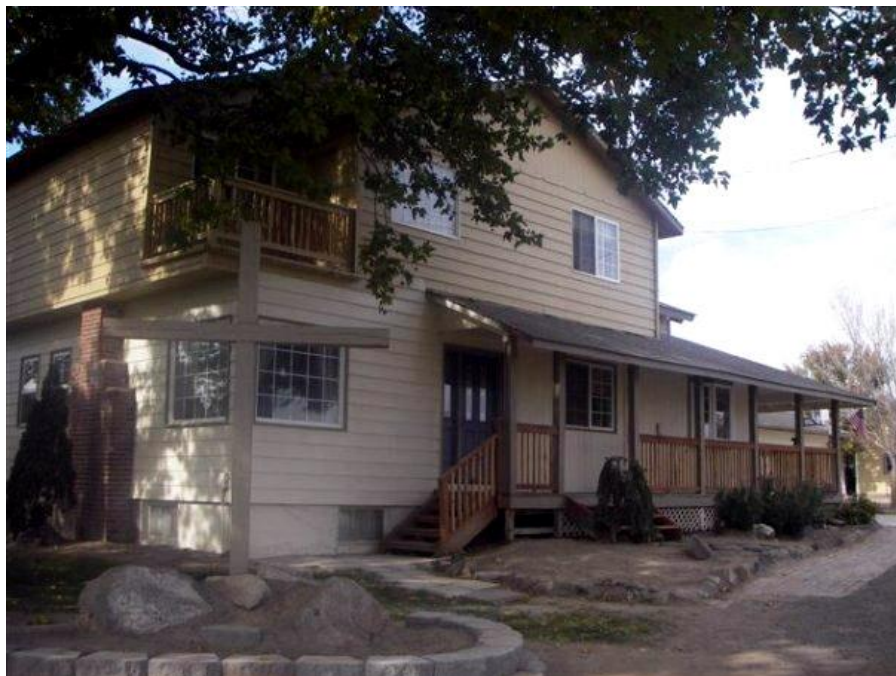
Standing Stones Ministry – outside Wapato, eastern Washington State