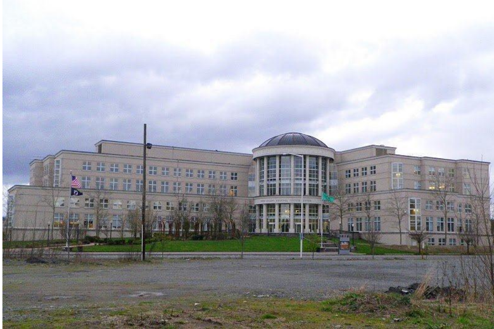
Kent Regional Justice Center