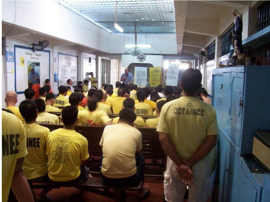
Manila – Rizal Provincial Jail