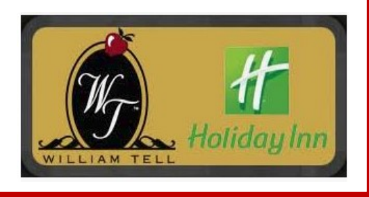
TABLE OF 10 $550 WILLIAM TELL BANQUETS AT HOLIDAY INN COUNTRYSIDE