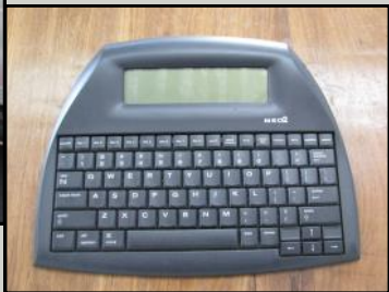
Alphasmart Neo used for keyboarding translation