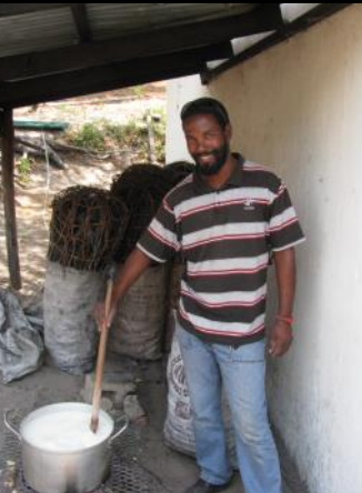
Cooking nshima for lunch