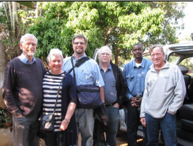
Three new consultants in this workshop series