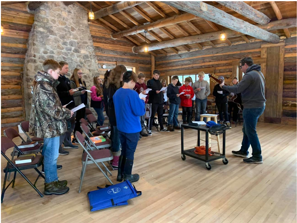
Blackfoot Lodge Retreat Meeting Space