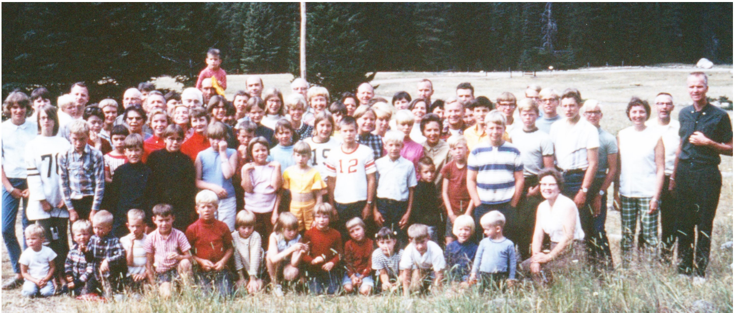
Carlson reunion in 1967.