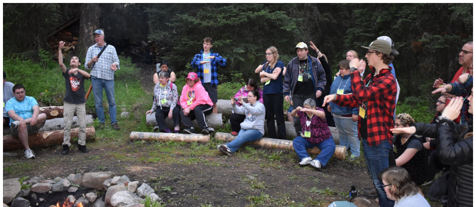
Campers and staff gather at the central campfire for worship at the end of the day.

I enjoyed watching counselors perform silly skits and chomping snacks at canteen time. The songs and family-style meals in the lodge felt welcoming. The exhilarating feeling of peaking a mountain for the first