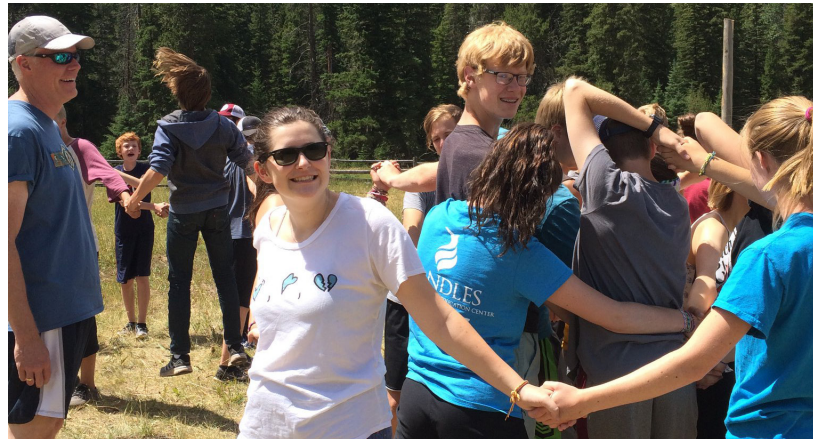
Campers play games in the meadow.