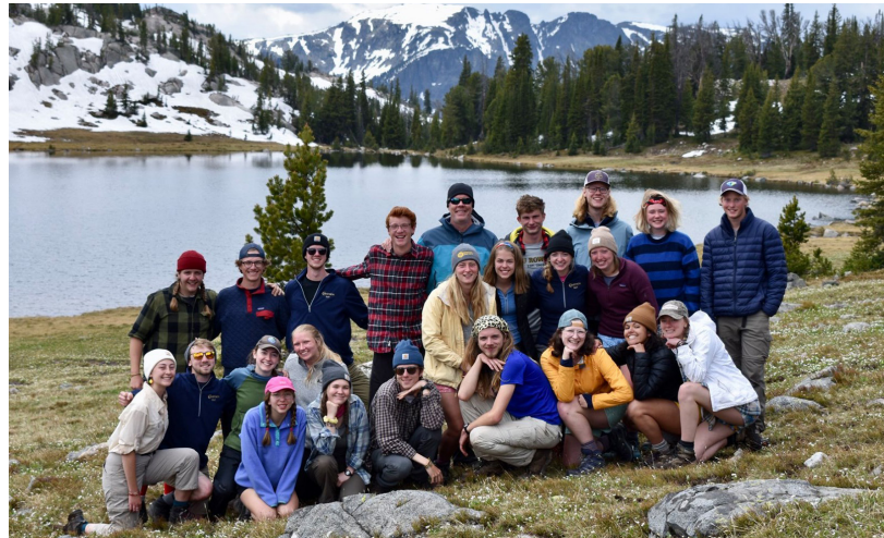
Christikon staff training for backpack on the Lake Plateau.

All this means Christikon's 2020 season will happen, even if the exact pattern and