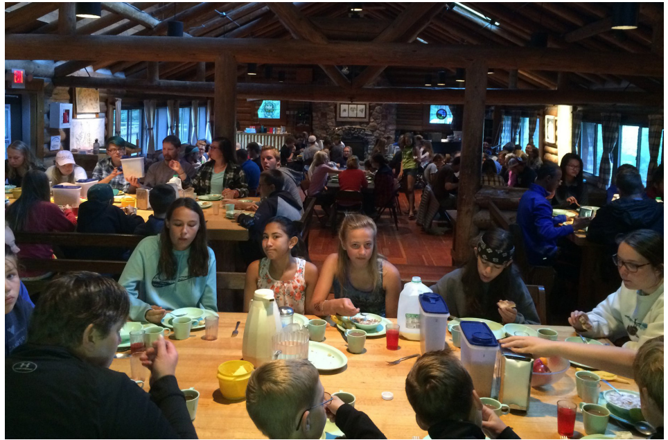
Campers gather in the main lodge for breakfast.