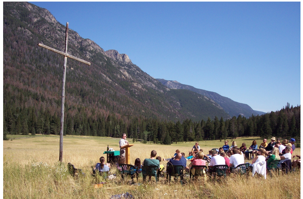
Campers gather for worship at the cross in the meadow.