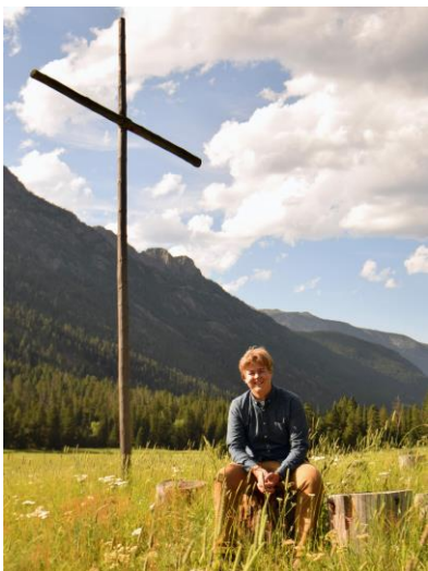
SKYVIEW HIGH SCHOOL