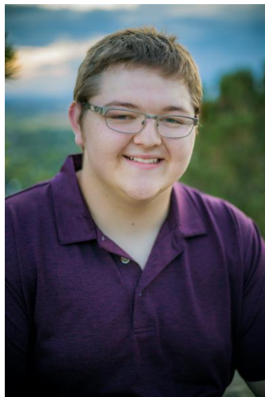
SKYVIEW HIGH SCHOOL

After graduation Race plans to apply for an Electrical Apprentice Program and with the possibility of participating in some college courses.