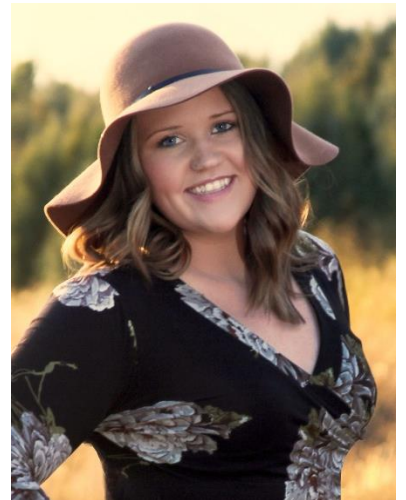
SKYVIEW HIGH SCHOOL