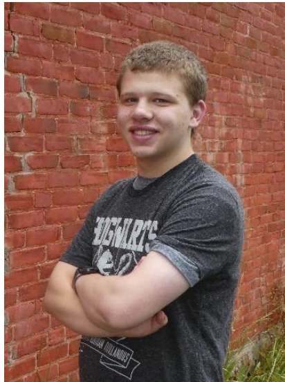
SKYVIEW HIGH SCHOOL