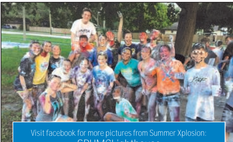
Visit facebook for more pictures from Summer Xplosion: SPUMCLighthouse