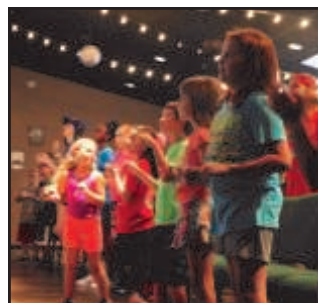
Campers at worship