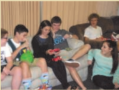
High School gift exchange

I would like to thank all the youth parents and volunteers who helped make our annual Youth Progressive Dinner a success. Everyone had a great time!