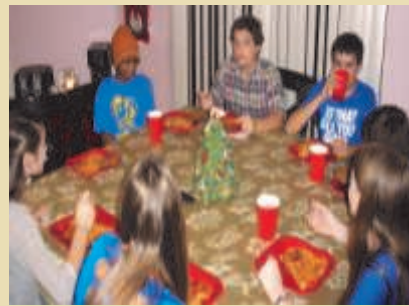
Mid-High Youth Progressive Dinner