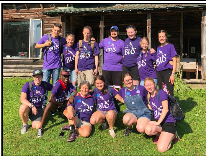
Unit #322, Summer 2019: Volunteers take a group photo in front of Pine Lodge at Inspiration Hills Camp before a work day in the community.