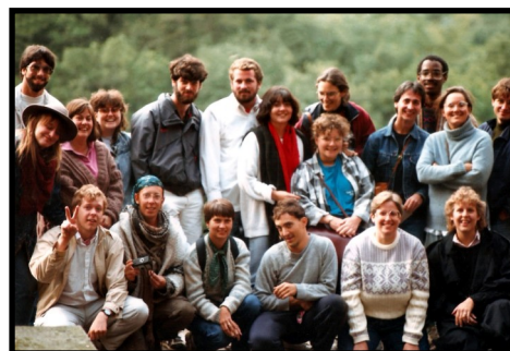
Europe Retreat in Germany, 1988