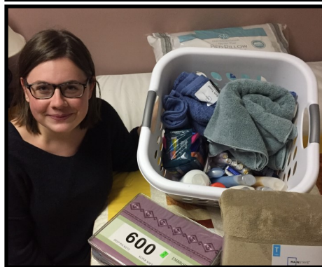
BVSers at Good Samaritan Services