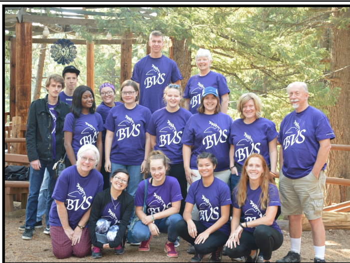
Unit 319, Summer 2018: Volunteers take a group photo in front of the gazebo at Camp Colorado before a work day in the community.