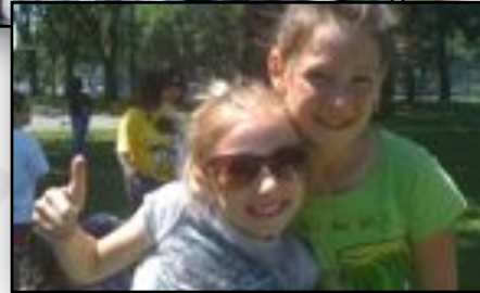
End of the year picnic.