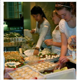
Taste our Amazing appetizers!