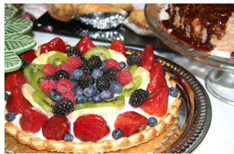
Come and Bid on our Incredible Desserts!