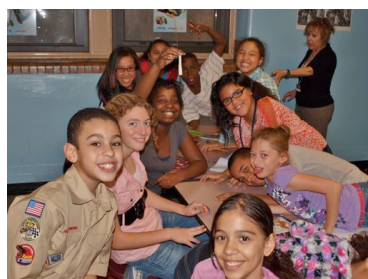
Jackson Elementary – Outreach Day