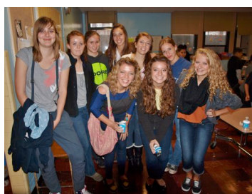
Jackson Elementary – Outreach Day

“It’s a good place to talk about our faith and learn more about it. We can have good discussions about Christianity without being drowned out. We certainly wouldn’t have this in public school,” she affirmed.