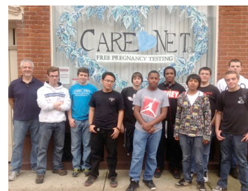
CareNet – Outreach Day