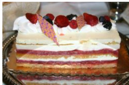
Come and Bid on our Incredible Desserts!