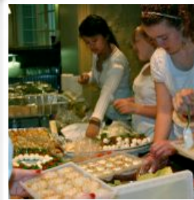
Taste our Amazing hors d'oeuvres