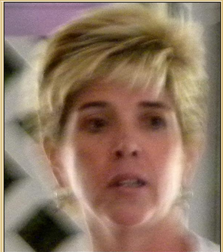
portrait of a police suicide survivor

This is the story of a dedicated State Trooper whose greatest sin was that he overcame his physical injuries from a horrendous on-duty accident and, after two years of surgeries and painful therapy, courageously met all the requirements to return to the job. Although he overcame his physical injuries each time, his department resisted his efforts to receive adequate psychotherapy for the one thing that would ultimately cost him his life--his PTSD.