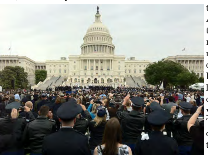
2013 Police Week - Capital, Washington, D.C.

National Police Week in Washington, DC is always a week filled