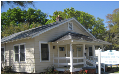
120 W. Hickory Street October 1998- October 2010