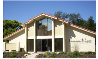
4435 Florida National Drive November 2010 - Present