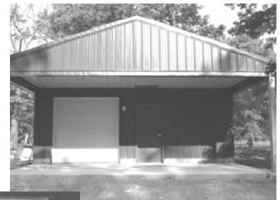
Front View Of New Laundry Building

If anyone has a set they would like to donate to the camp, or would like to purchase a set for us, we would be so grateful!!