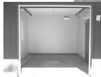
Program Storage Bay With Garage Door Easy Access

We are so thankful to NCHS for our grant money, and for all our volunteers who donated time and money to help us finish this much-needed project!