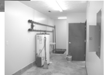
Water Processing Area

We still have to install the water softeners and chlorination, plus hook up the washers and dryers.