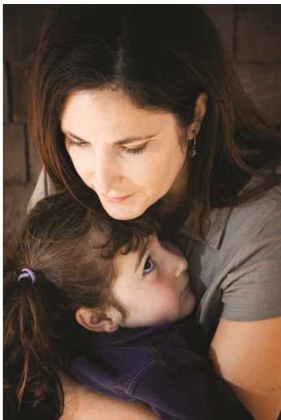
Violence against one affects every member of the family.

SPARCC is the only state-certified center for domestic violence and sexual assault services for Sarasota and DeSoto Counties. They provide multiple emergency and on-going services for survivors of abuse. They are also engaged, through community education programs, in addressing and changing social norms that support violence against women.