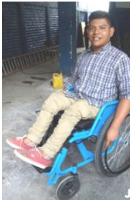
A "second generation" wheelchair design.

Seventy million people are in need of a wheelchair, but cannot afford one. A wheelchair provides mobility, independence, the ability to participate in society and earn a living, and dignity. It's impossible to put a price on these benefits – but you can put a price on the wheelchair... it's $80. Northminster supports Free Wheelchair Mission, an international nonprofit organization, through your Mission Offerings. FWM is offering to match all gifts received during the month of October. If you'd like to make a gift specifically for this cause, please write "FWM" on your envelope or on the memo line of your check.