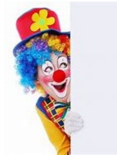
Coming Soon: Summer Circus Spectacular!