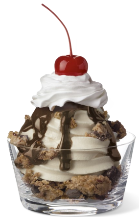
Ice Cream Social June 3, after church