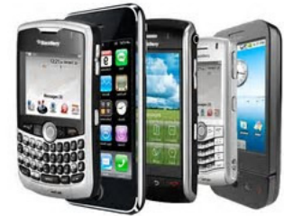
SPARCC distributes cell phones programmed to 911 to help those in crisis.

Safe Place and Rape Crisis Center collects used cell phones to help survivors of domestic violence and sexual assault. They are refurbished and programmed to serve as 911 phones to help those in crisis. Phones do not have to be in working order. If possible, please include chargers and clear phones of personal information.