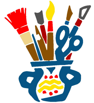
Arts & Crafts Workshop Every Wednesday

Coffee and refreshments are served outside, in front of the sanctuary, after the Worship Service. Stay for a while, enjoy a cup of coffee, and connect with your fellow worshippers.