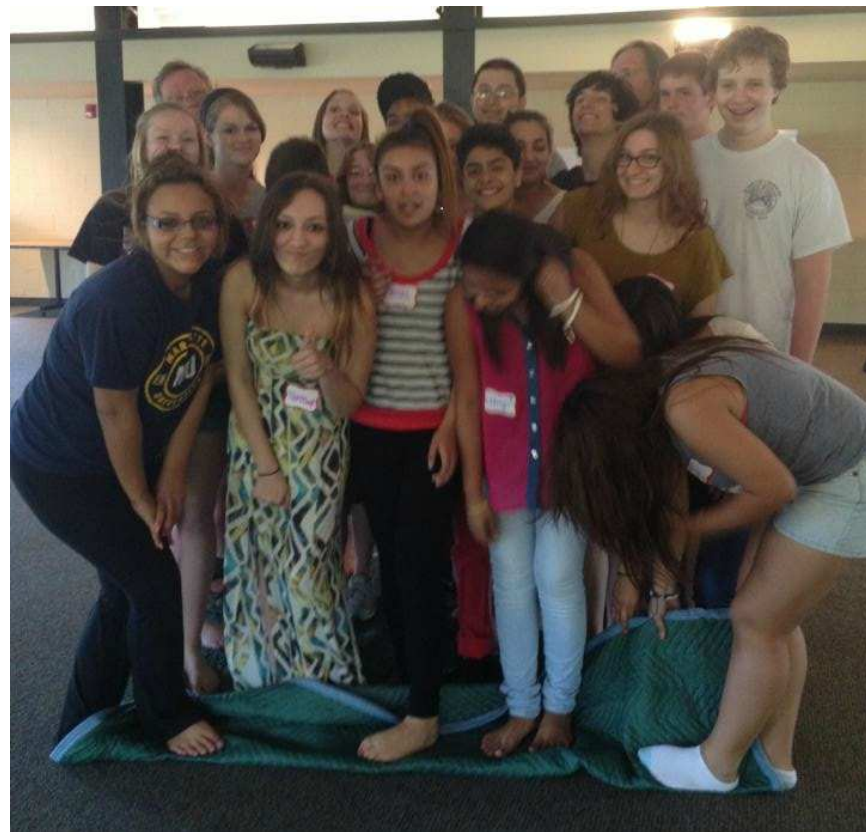
The 2013 Mission Trip crowd from St. Michael's and Redeemer take a "Magic Carpet" ride at a pre-mission trip meeting!