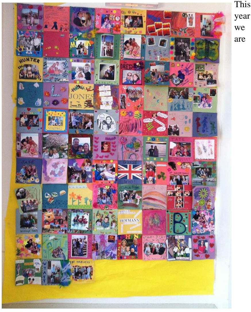
Little Angels Preschool Family Quilt

offering seven weeks full of fun and exciting activities for children aged 2-6 years. Please click <u>here</u> for a registration form with the dates and details.