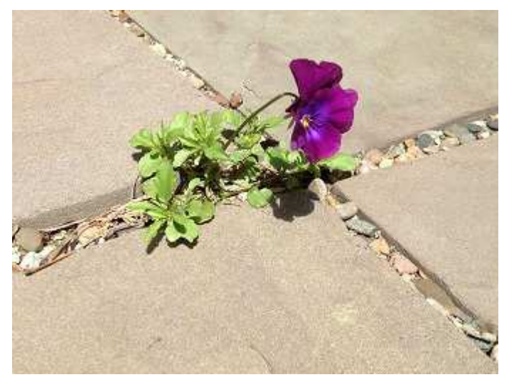
Lone pansy between the blocks in the columbarium.

+The total collected in support of the Bishop's Discretionary Fund during his visit on Sunday, April 28 was $1,254.04. Thank you for your generosity!