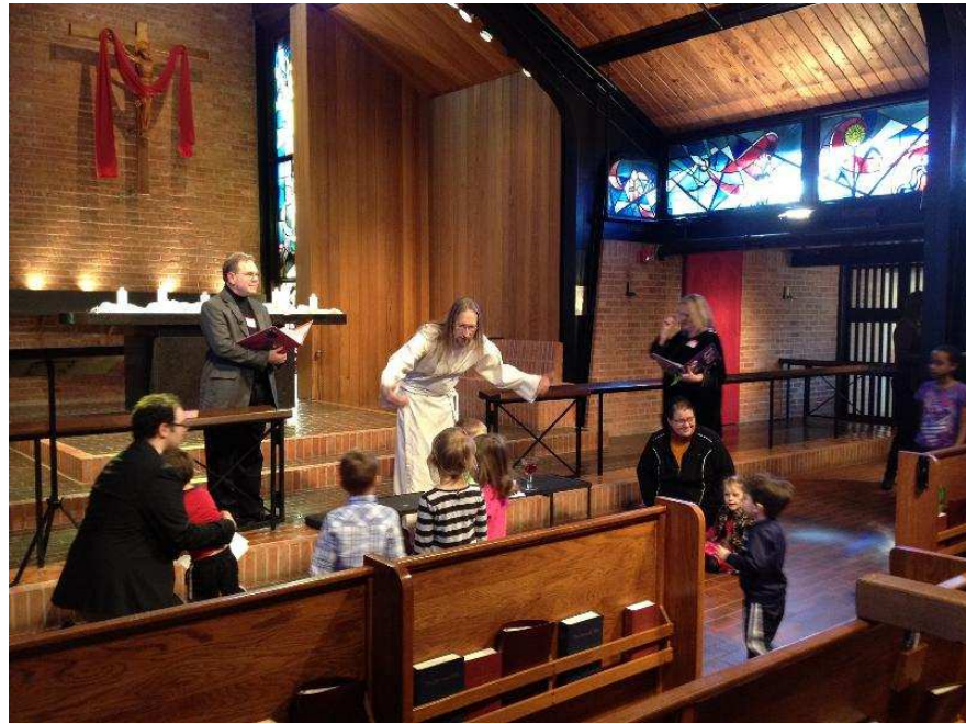
Walk Through Holy Week Service on Good Friday