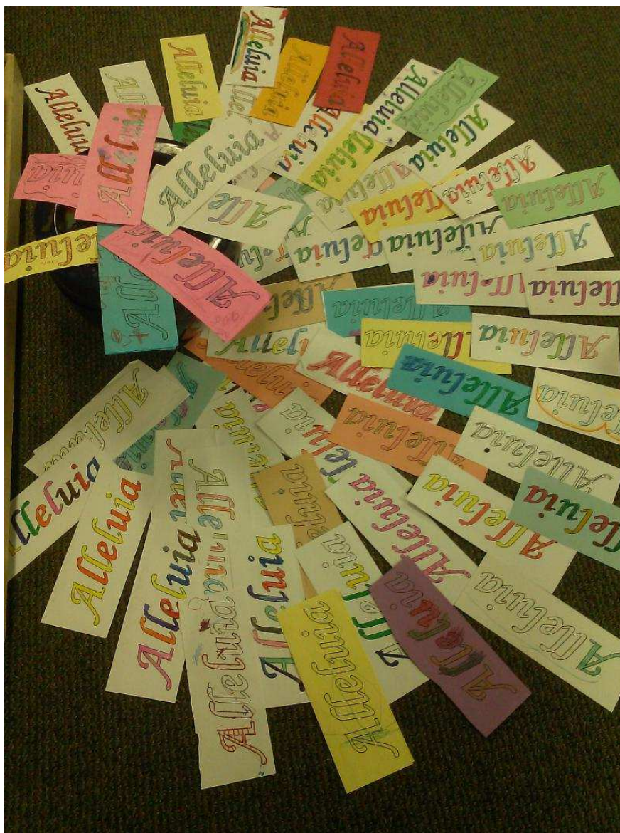
"Alleluias" unburied by the Children's Altar.