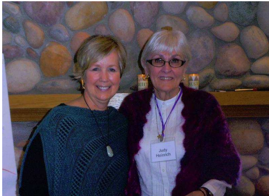
Deacons on Retreat.