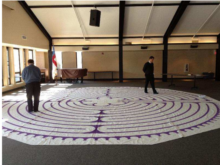
As part of our Food for the Journey Series, we brought a labyrinth from St. Charles into the Community Room.