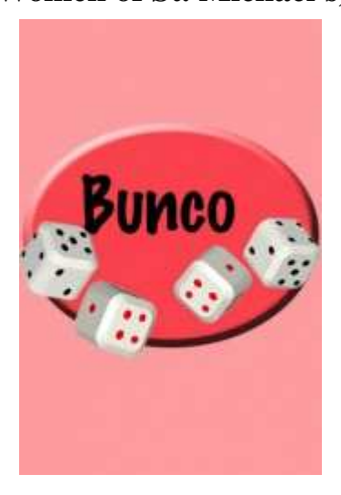
Tuesday, February 5th 7:00 - 9:30 p.m.