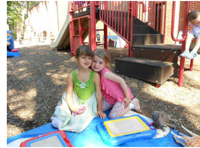
Summer Camp 2012

beginning school on September 4th. We have added a Pre-K class and a two day three year old class this year. We do still have openings in several of our classes so if you know someone or have a neighbor looking for a preschool, please pass our name along. Hope you all noticed the new sign on the glass entrance windows of the church and on the preschool entrance doors. They certainly make the Preschool's presence known here at St. Michaels! The Preschool website may be accessed by clicking here .