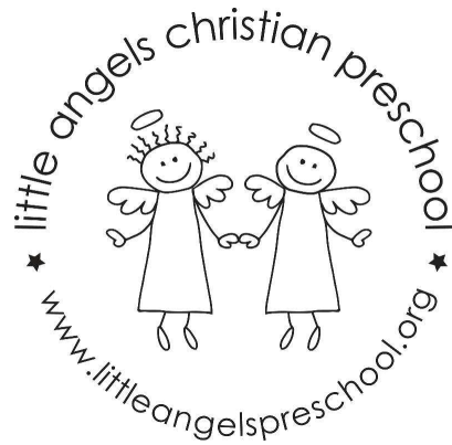
New Window Signage