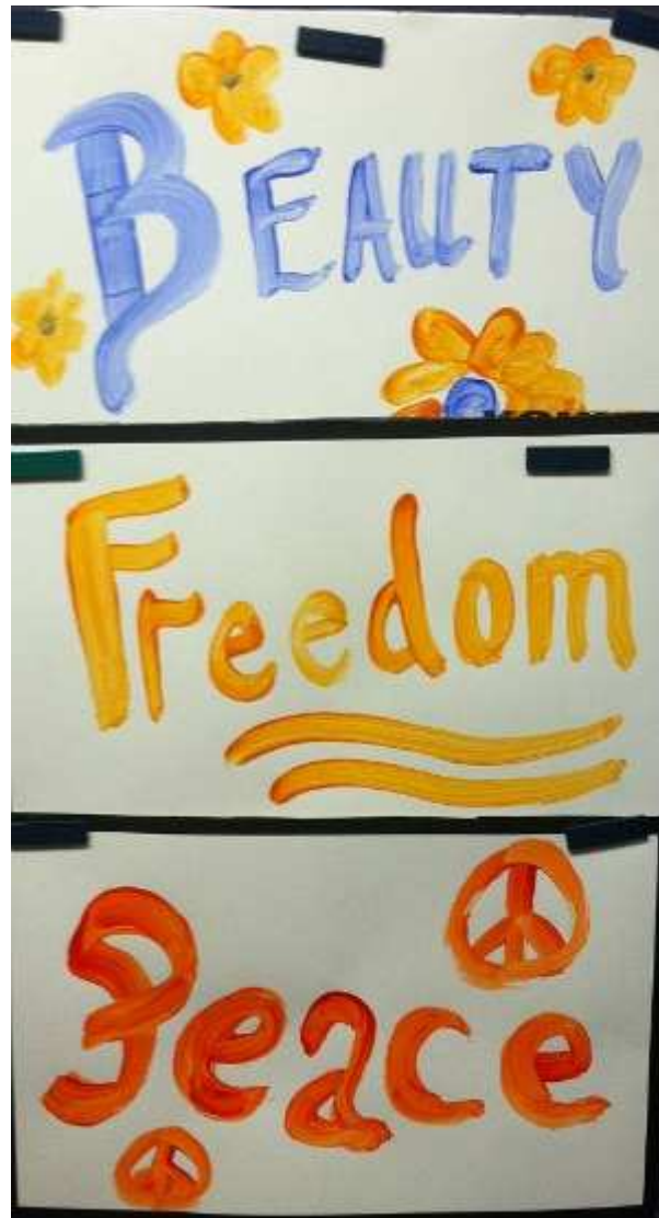
Last words from the Advent Pageant.