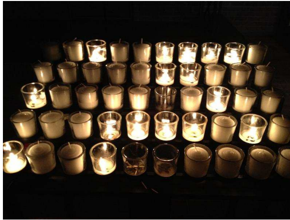
Candles lit as part of the Praying in the Wilderness service.