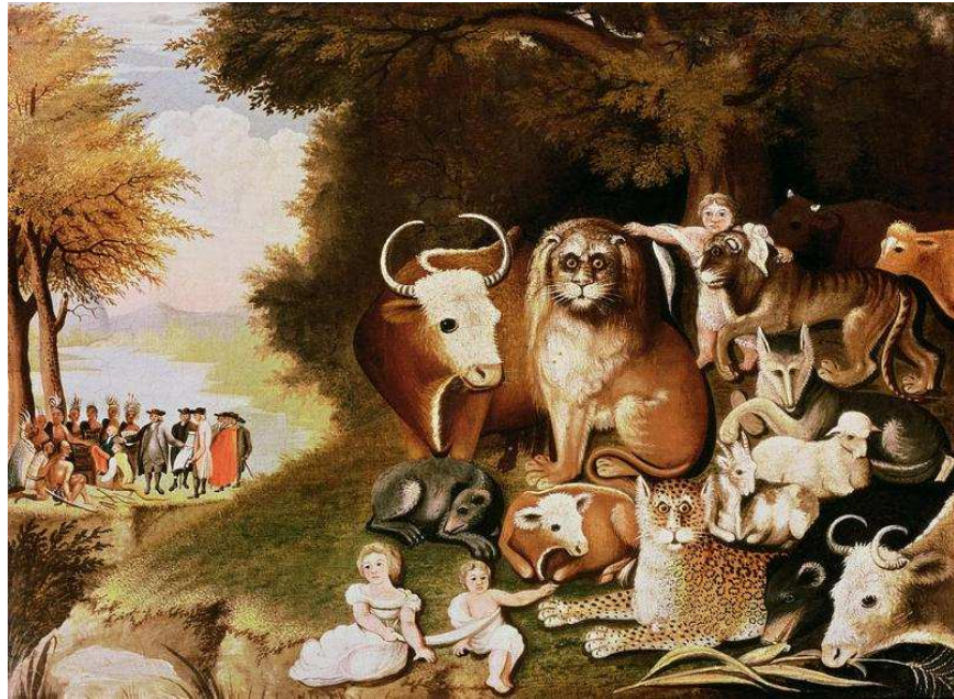
The Peaceable Kingdom, Artist Edward Hicks, oil

Advent Pageant, Sunday, 16 December, 9:00